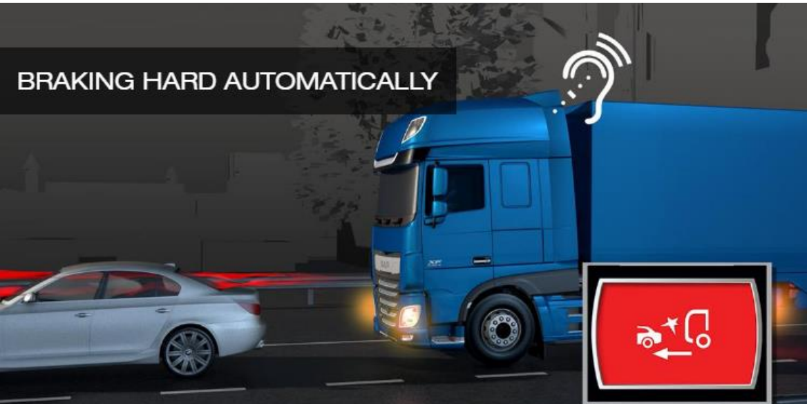
Advanced Emergency Braking System