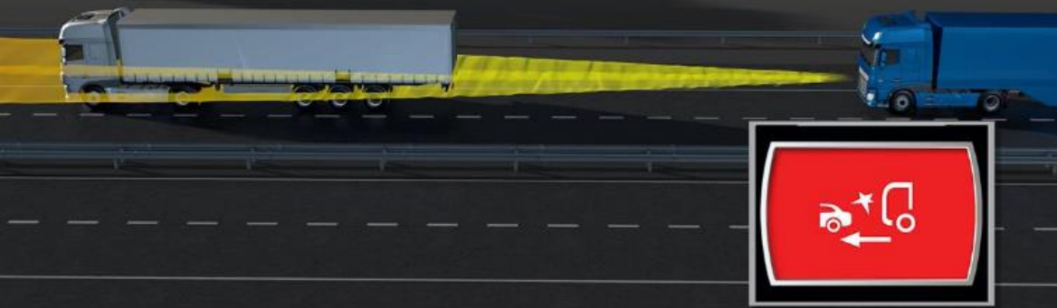
Forward Collision Warning